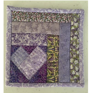
Linda O's Block for Hospice

Thank you for contributing your time, skill, and compassion to create quilted squares in purple, a color deeply significant in end-of-life care. In many healthcare settings, purple serves as a signal that a patient is nearing or has reached the end of their journey. The color purple represents spirituality, dignity, and peace, making it a meaningful choice to convey respect and honor for both patients and their loved ones during this sensitive time.