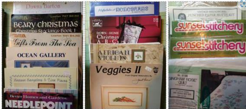
MANY, MANY PATTERNS AND SOME BOOKS

1. Large box of cross stitch and needlepoint items: kits, fabrics, needles, and many patterns. A small sample of the items: