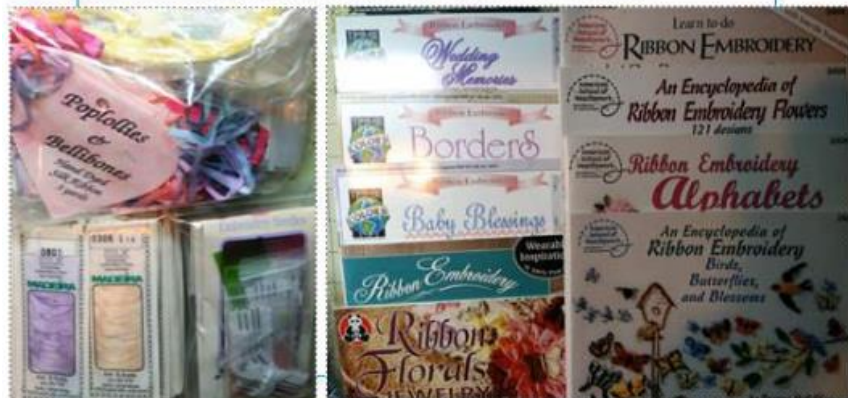
RIBBONS, FLOSS, NEEDLES