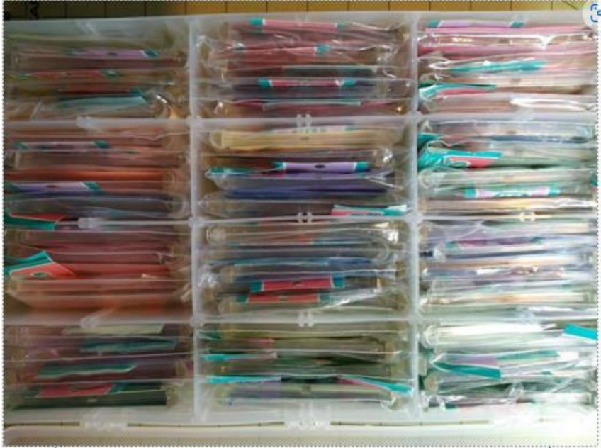
BOX WITH CLOSE TO 100 SILK RIBBONS

2. Box of ribbon embroidery items: silk ribbons, pattern books, silk floss, needles. Joy couldn't recall the name of the person she wanted these to go to—it was the person who had a rather large fabric fairy-like doll on display at a guild meeting some time ago—maybe even pre-COVID. If you're that person, please contact me. But if anyone else wants this collection, please go ahead and let me know, in case the unknown person doesn't turn up.