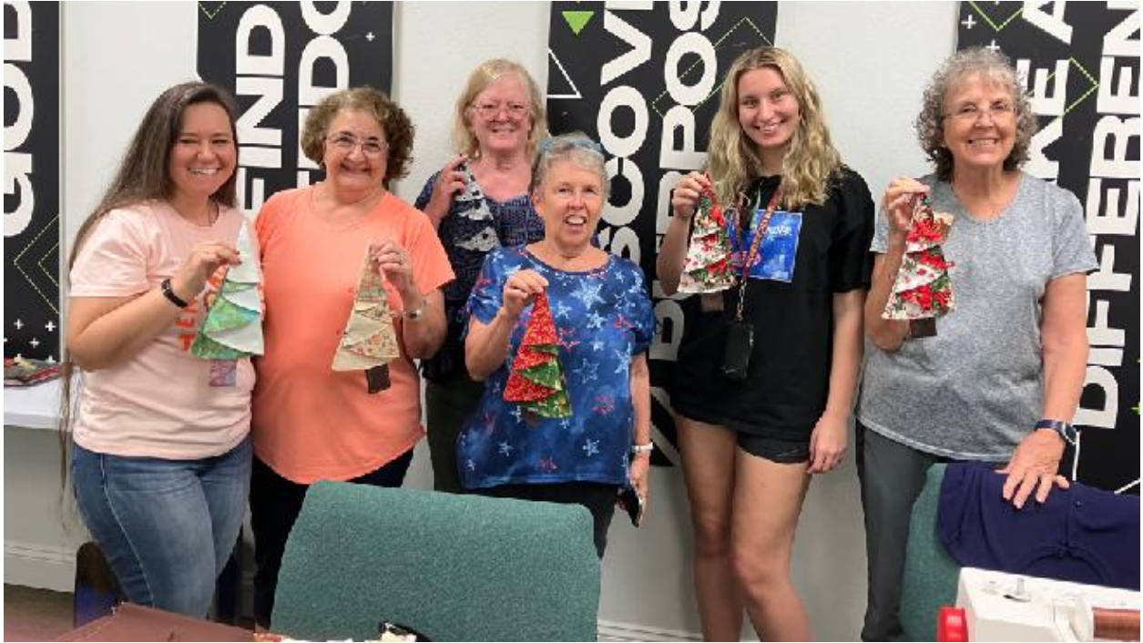
Attendees at the Holiday Trees class show off their work.