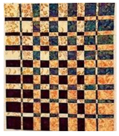
Lyn Geariety – Jan 2025

Class fee: $10 to offset community center registration fee. Pam has shown examples before and will in subsequent QU meetings. Samples of student work from class are shown below.